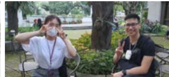
UA&P 어학연수의 꽃~ 버디 매칭 프로그램~